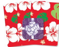
Saved Present Pile

REPEAT STEPS 1-5 UNTIL A PLAYER HAS NO CARDS LEFT.