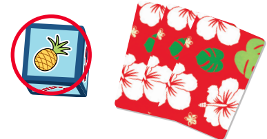
Discard ALL Played Cards

If none of the rolls match any present on any of your face-up cards, you save the presents! Flip all the cards you played face down and place them in a stack under your Saved Present token. Don't draw any cards.