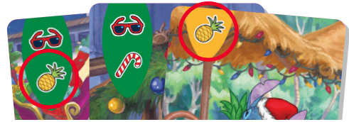
Roll Matches Present

Take turns rolling the Present die, but each roll affects everyone.