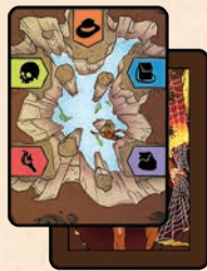
11 INDIANA JONES TEMPLE CARDS