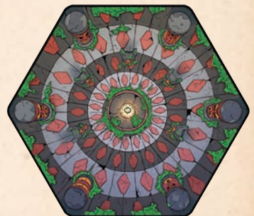
IDOL CHAMBER TILE