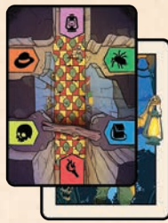
11 RENÉ BELLOG TEMPLE CARDS