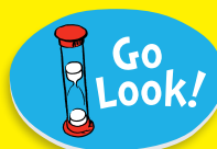
Go Look! Tile

Flip tiles to ask the Hider questions about where the Things are. When you flip Go Look! , follow the clues you've been given and find the Things before the timer runs out to win!